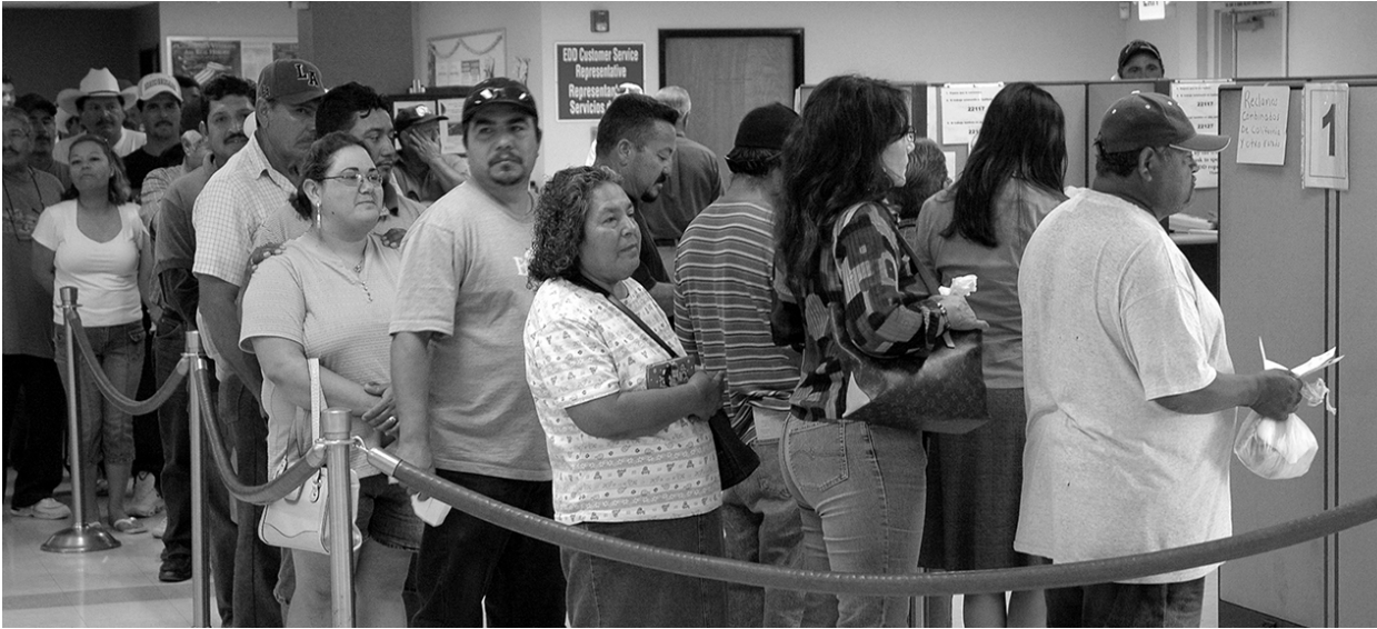
PHOTO: Unemployed workers, Calif.

Millions of Americans are unemployed, and millions more are being hurt by budget cuts that continue to dig deeper and deeper. Meanwhile, CEOs of super-rich defense contractors — contractors whose stocks have doubled in a decade — continue to pad their pockets with public money by producing military hardware and weapons systems that the Pentagon doesn't even want. We demand a change in our federal spending priorities — move the money!